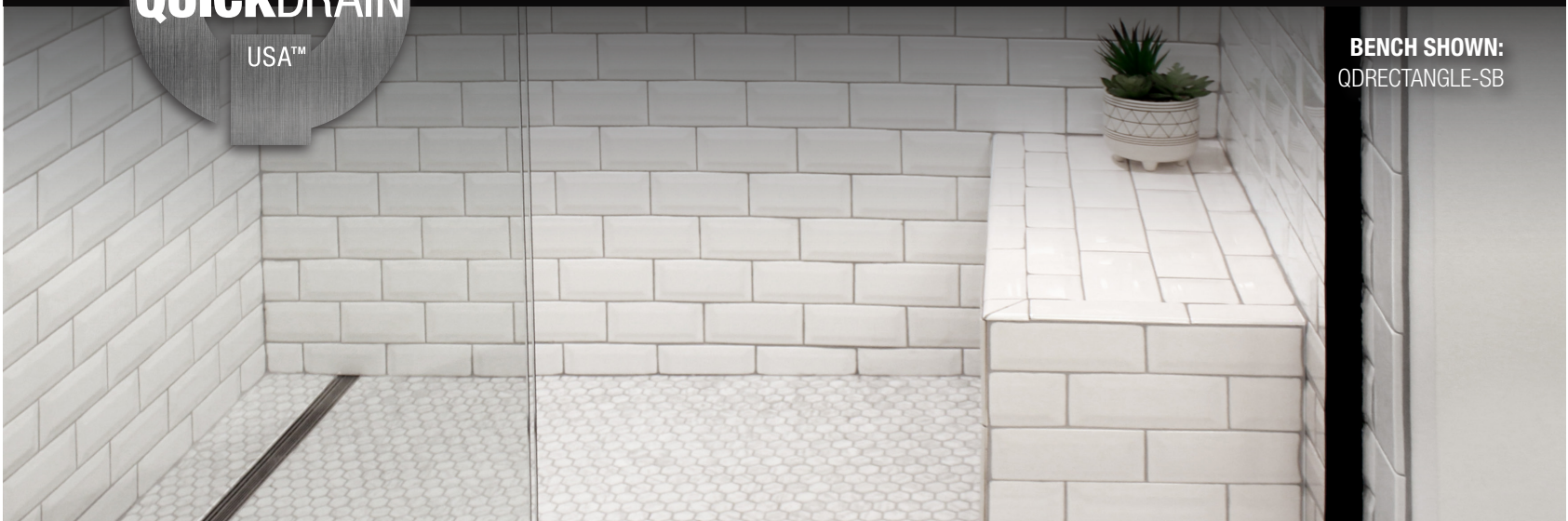
BENCH SHOWN: QDRECTANGLE-SB